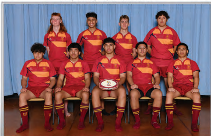
King Country Boys Sevens U16s