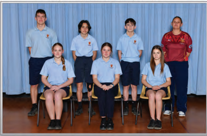
Ōtorohanga College - 2023 King Country Swimming Championships