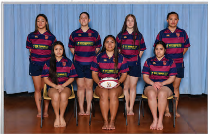
King Country Girls Sevens U15s