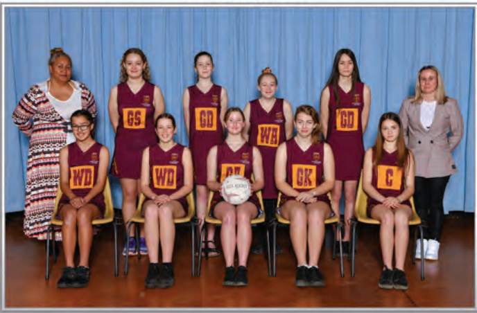
Ōtorohanga College - 2023 Netball College Gold