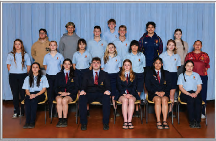
Ōtorohanga College - 2023 Volleyball Festival