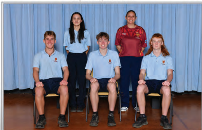
King Country Badminton